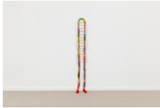
Tanya Aguiñiga 1978 Luz de Sol , 2022 Ice-dyed cotton rope and synthetic hair 89h x 12w x 2d inches 226.06h x 30.48w x 5.08d cm (TA199)

In this group exhibition, artists and designers share a common desire to honor where they come from with objects of beauty and brilliance and of enduring meaning and substance. The many perspectives, cultures, and geographies represented in Chicago are brought to life here as these makers intend to better our world through art and craft.