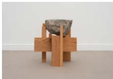
Sung Jang Given , 2024 Granite and oak 17h x 16w x 12d inches 43.2h x 40.6w x 30.5d cm (SJ058)