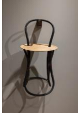
Norman Teague Thonet Tray Chair Thonet chair parts, table tray 34.5h x 18w x 18d inches (NT002)