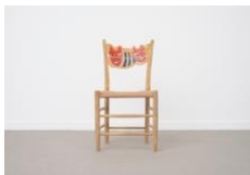
Robell Awake Blue Blood, Red Pill , 2025 White oak, hickory, paper cord, rhinestones, milk paint, acrylic ink, acrylic paint, and found bottle cap 34.5h x 18.5w x 17d inches 87.6h x 47w x 43.2d cm (RA002)