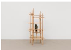
Sung Jang Given , 2022 Granite and red oak 79h x 41w x 32d inches 200.66h x 104.14w x 81.28d cm (SJ029)