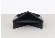
Stephen Burks Tableau , 2023 Oak 20h x 40w x 40d inches 50.8h x 101.6w x 101.6d cm (SB004)