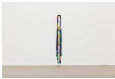
Tanya Aguiñiga 1978 Mezclilla Neón , 2022 Ice-dyed cotton rope and synthetic hair 93h x 10w x 4d inches 236.22h x 25.4w x 10.16d cm (TA198)