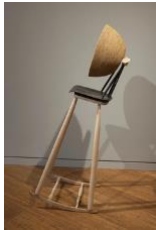
Norman Teague Long Rocker Basswood turned legs, chair & weaved basket 69h x 22w x 27.5d inches (NT001)