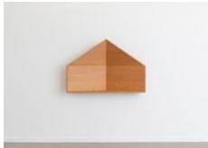
Stephen Burks Altar , 2023 Douglas fir 39.5h x 59w x 12.75d inches 100.3h x 149.9w x 32.4d cm (SB003)