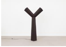
Stephen Burks Ypsilon , 2023 Oak and lighting components 85h x 50w x 17d inches 215.9h x 127w x 43.2d cm (SB005)