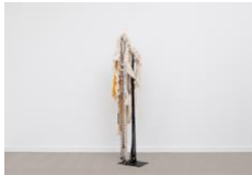
Tanya Aguiñiga 1978 Matriarchal Womb 3 , 2022 Cotton rope, polyester spaghetti strap, cane, and steel 73h x 20w x 20d inches 185.42h x 50.8w x 50.8d cm (TA190)