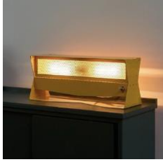
Larry Tchogninou RTU Lamp Steel and PE sheeting 8h x 18w x 6d inches 20.3h x 45.7w x 15.2d cm (LTC001)