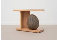
Sung Jang Given , 2024 Stone and oak 17h x 27w x 13d inches 43.2h x 68.6w x 33d cm (SJ070)