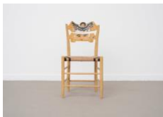
Robell Awake Blue Origin , 2025 White oak, hickory, paper cord, rhinestones, milk paint, acrylic ink, acrylic paint, found packaging materials, currency, corrugated plastic, and Prozac 34h x 17w x 17d inches 86.4h x 43.2w x 43.2d cm (RA003)