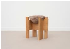
Sung Jang Given , 2025 Stone and oak 18h x 18w x 12d inches 45.7h x 45.7w x 30.5d cm (SJ073)